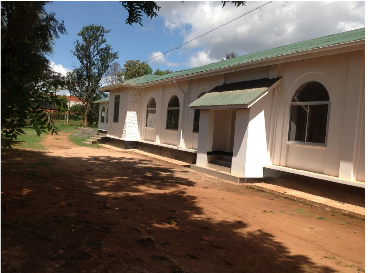
NHIF building at Morogoro Regional Hospital rehabilitated by the Fund through facility improvement loan.

As of 30 th June 2015, the Fund has approved Medical Equipment Loans to 229 facilities and Facility Improvement Loans to 69 facilities . Out of the approved amount for medical equipment loans, 112 facilities have already utilized the approved amount and collected medical equipment. Whereas, out of approved amount for facility improvement, the Fund has disbursed payments to 18 facilities.