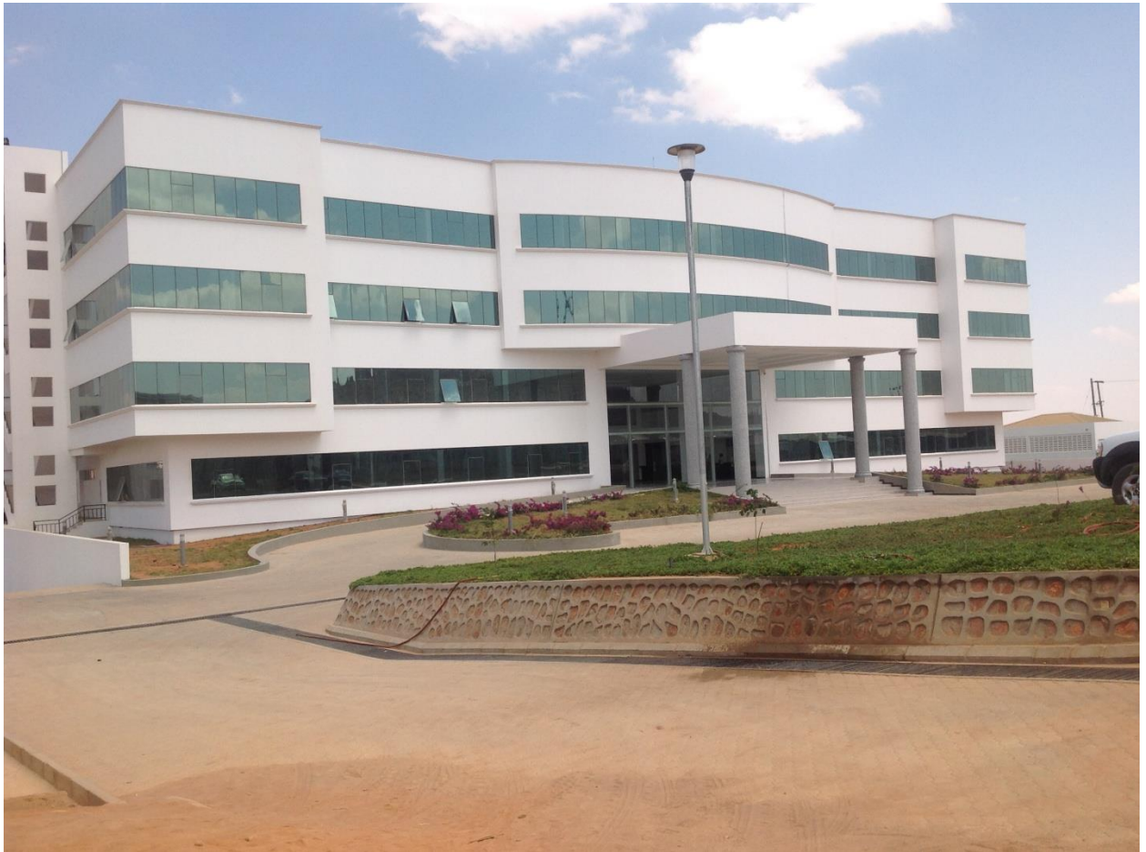
Modern Diagnostic Centre at the University of Dodoma funded by NHIF Tanzania