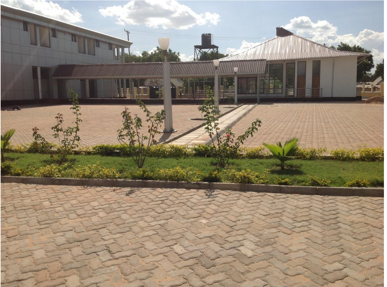
The Centre of Medical Excellence at Dodoma Regional Referral Hospital financed by NHIF