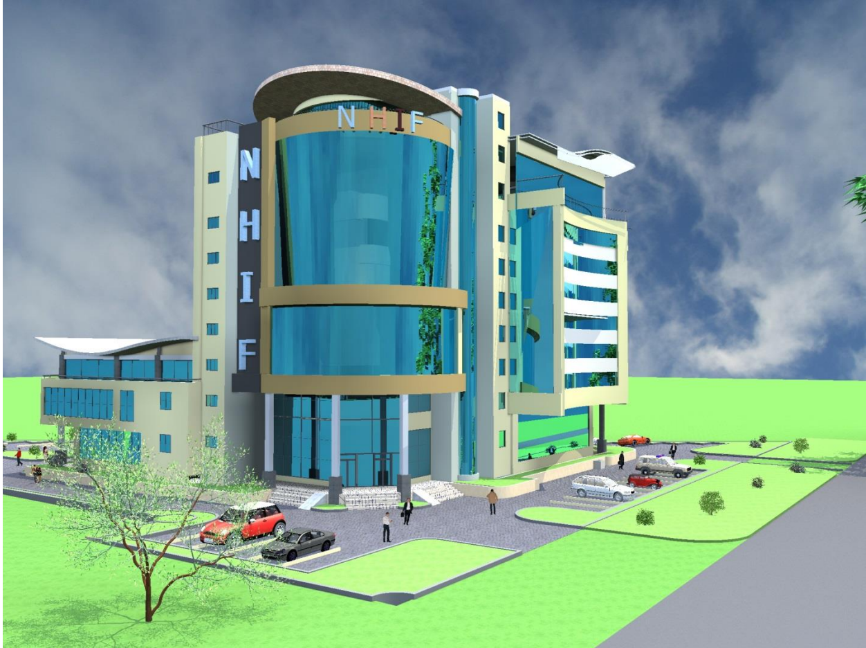
Proposed NHIF Regional Office for Dodoma