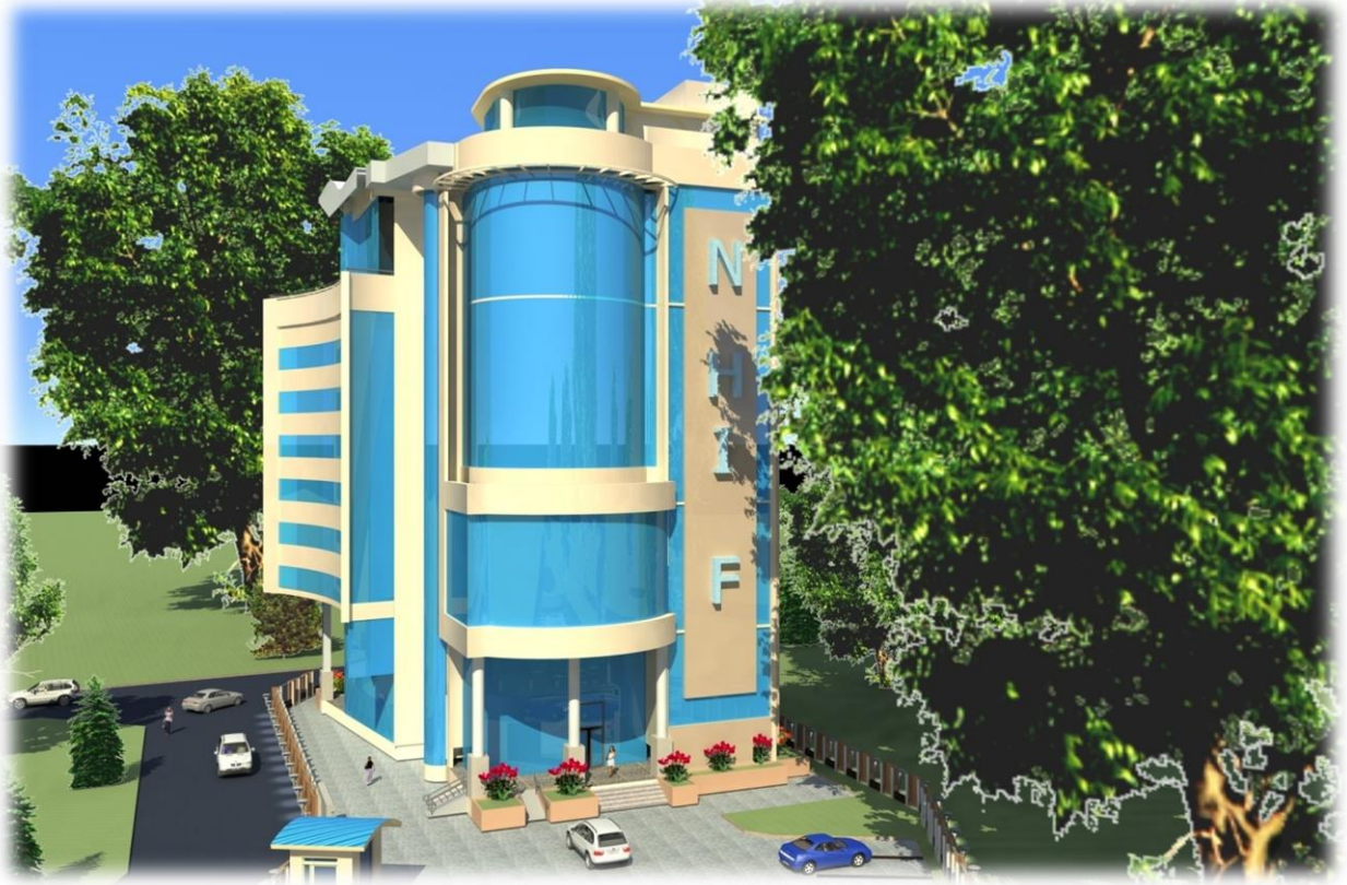
Proposed NHIF Regional Office for Tabora