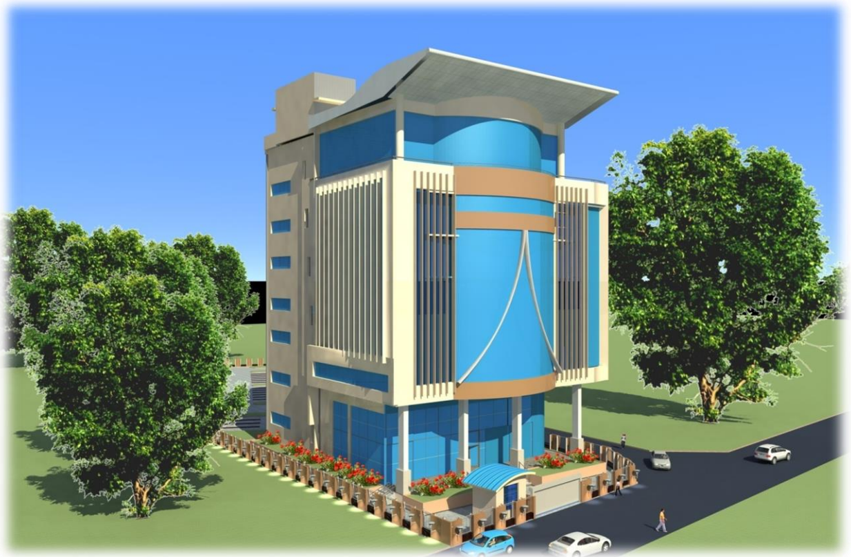
Proposed NHIF Regional Office for Tabora